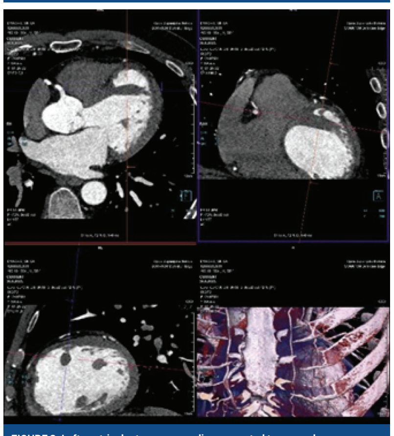
FIGURE 3. Left ventricular tumor on cardiac computed tomography.

Conclusion: Echocardiography is an important tool in intracardiac mass evaluation and identification of the LV mass size, shape, mobility and attachment is important do differentiate LV thrombus from tumors. An intracardiac mass should be assessed in multiple views, both during systole and diastole. Cardiac MR or CT should be used to confirm the diagnosis.